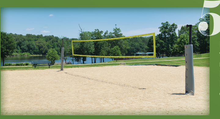
Play a volleyball match at Bringle Lake Park sand courts.

Play a round of Frisbee Golf at Spring Lake Park.