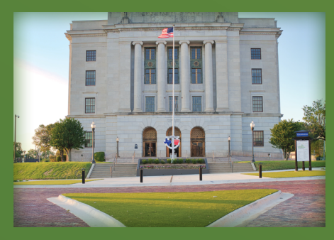
You can also visit two states at once at the newly renovated Photographer's Island in downtown Texarkana, USA.

1930 U.S. Coast and Geodetic Survey stone marks the spot where Texas, Arkansas and Louisiana meet. The exact location, appropriately known as Three States, is in Cass County, Texas.The marker can be found on Texas Highway 77 and Louisiana State Highway 1.